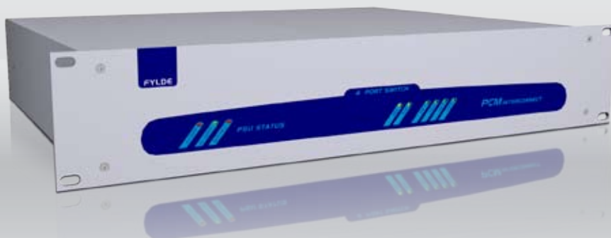
PCM 2U rack chassis 4 Port or E1/T1 cards.