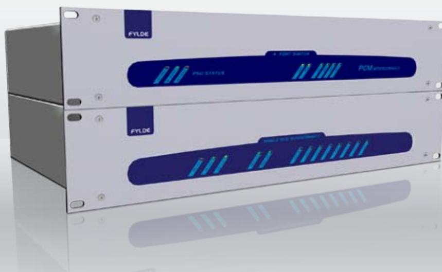
PCM 2u rack chassis SSIU 2u rack chassis