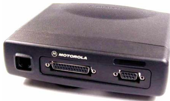
GCN6118 MAP27 Expansion Head

Note: All Product Manuals include Full Feature User Guide, Selling Guide, CPS, Installation Manual and Basic Service Manual